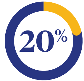
average retail gym membership savings with One Pass Select 3

Half of U.S. consumers report wellness as a top priority in their daily lives. 1 One Pass Select™ is designed to help make it easier for your employees to prioritize their health and wellness through a low-cost, extensive nationwide gym network, digital fitness and grocery delivery service. Best of all, your employees have the freedom to choose the option that fits their needs and lifestyle.